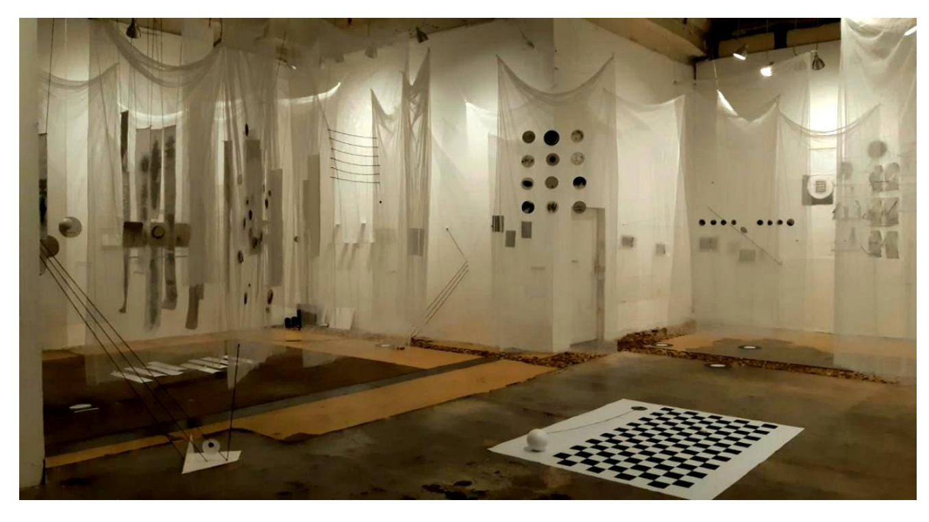
- Pallavi Majumder